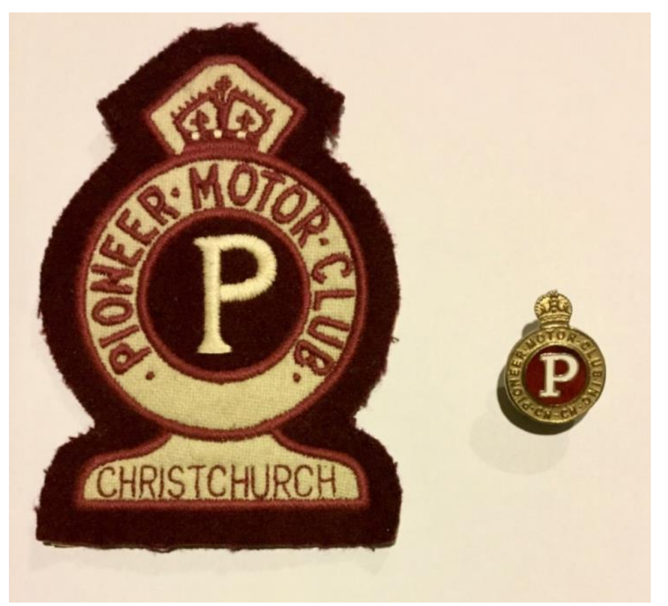
Collectable items now: a cloth patch for a blazer, and the little metal badge.

Older members will remember the club badges which were around in the 1960s and may date back to the 1950s.