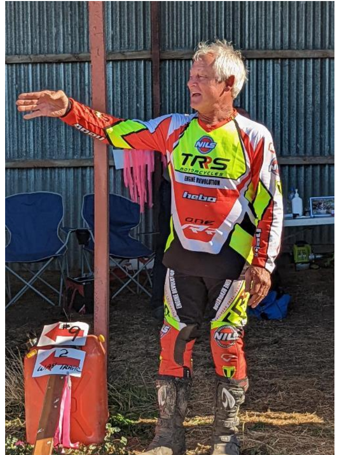
The loop is in that direction ...