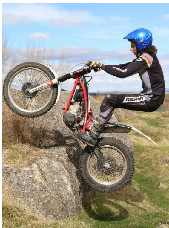
2023 in New Zealand, on his favourite make of bike at a practice day with the Oceania team in August.