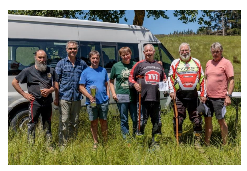
The cup and award winners at the Greybeards