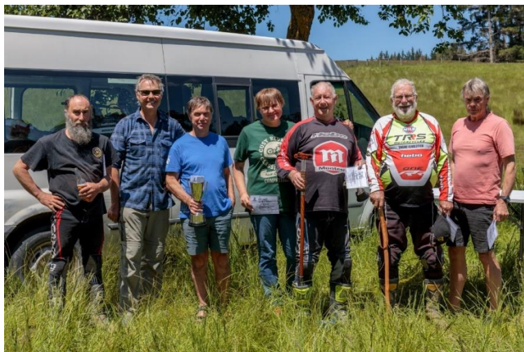
The cup and award winners at the Greybeards