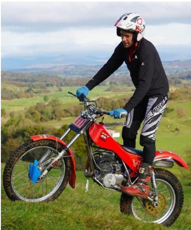
Riding a TY in the Westmorland Club's John Holmes Memorial Trial

My local club was the Westmorland MCC in Cumbria. It's quite a big club that runs lots of events from different disciplines like hill climbing, motocross, classic and modern trials.