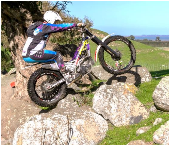
... and at Graylees a month later

Overall, the Wellington sections were quite feature-rich. They mostly had several crux moves, while still having enough technical riding to ensure that the approach or setup for a crux was not trivial. This is in contrast to the sections at Manderley which, for me, are almost entirely technical riding with few features. Little at Manderley intimidates me or makes me think I won't get up or over the feature, but the technical terrain is relentless. I struggle in that terrain, though one could argue looking at the scores, that we all struggle there. Graylees is a great property. For me it's still more of a technical ride. It has the relentlessness that makes Manderley a great challenge, but it has a little more variety. At the end of it, my scores were comparable between the Wellington sections and the Manderley/Graylees sections. Those rocky creeks are not a strength for me, but both events were great fun. Wellington was a great experience thanks to a new terrain and setting style, some lucky weather, and the people I travelled with. If you haven't been, you should put it on your list!