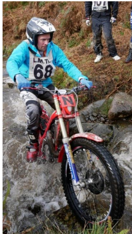
At the two day Lakes Trial in Cumbria