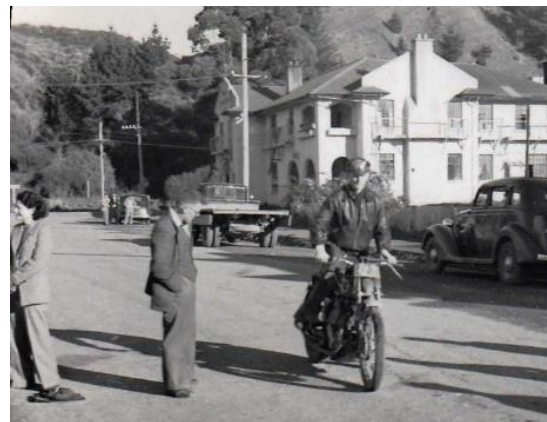
An unknown rider starts his bike in Kaikōura in the 1950s. The Commercial Hotel is in the background.