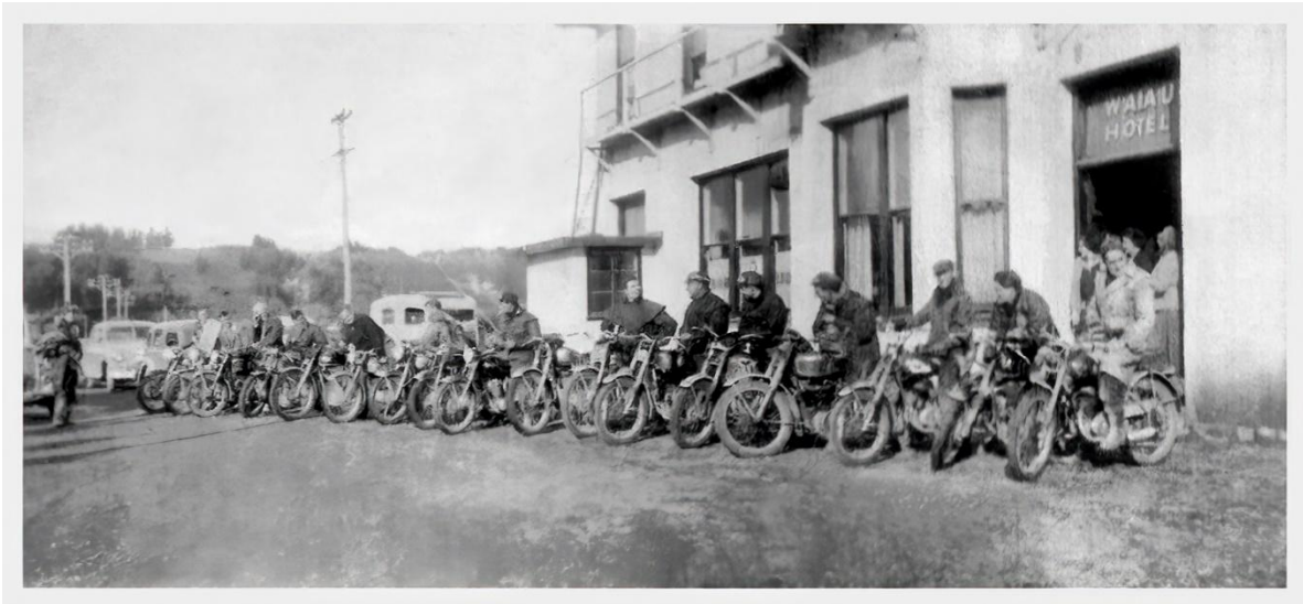
The earliest photo we have of the Kaikōura: the lunch stop at the Waiau Hotel in 1951.