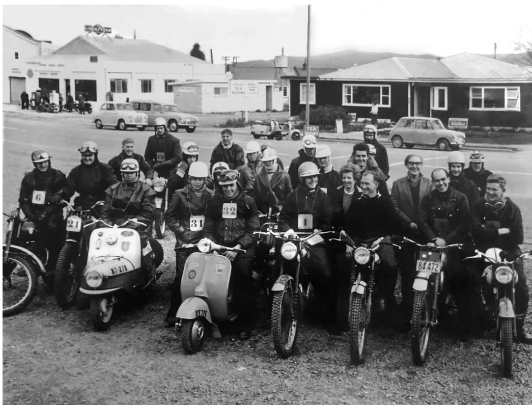
Riders at Cheviot on day 1 in 1963