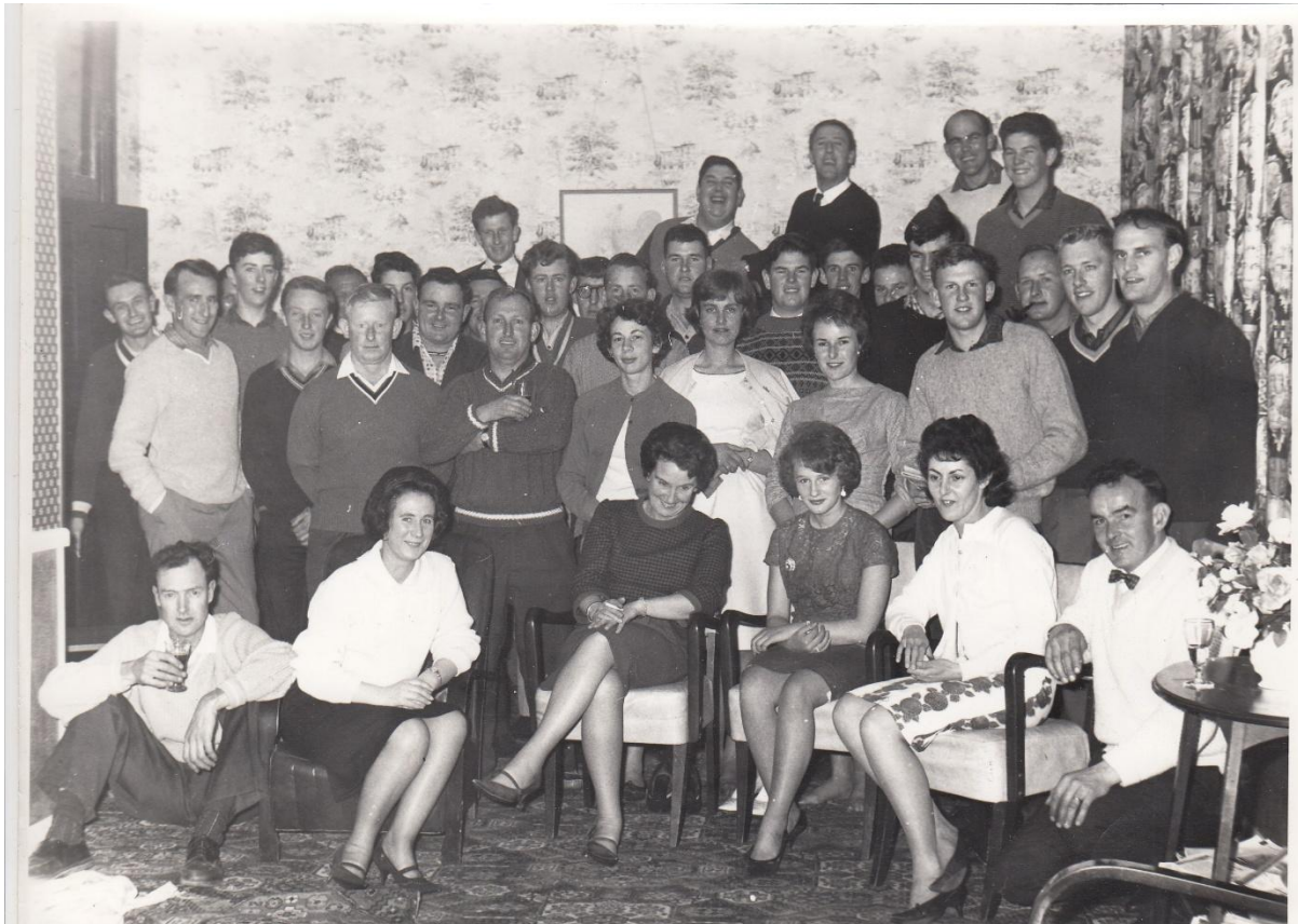
Riders and their partners at the Adelphi Hotel in 1964

1970 was the beginning of a new decade, but the Kaikōura trial that year was the end of an era. It was the last year that a rider on a British bike won the trial. In the next few years new Spanish, Japanese and Italian trials bikes would become readily available and the number of riders attending the 3 day trial would increase significantly. Riders from other parts of the South Island would become involved, new properties would be used and more classes would be introduced.