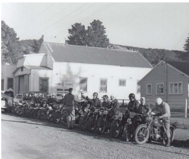
Riders briefing outside Fisher's Garage in 1962